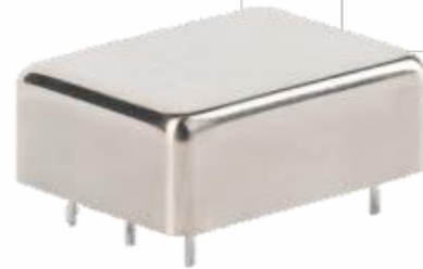
Dimensions: 35.4 x 26.7 x 12.65 mm