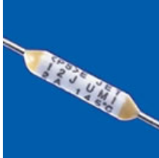
The photo of 12J is shown