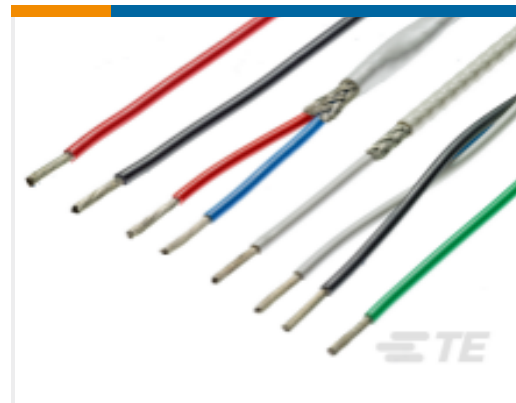
TE Model / Part #2823013001 44A0211-8-9