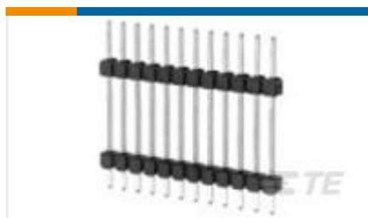
TE Model / Part #6-146459-4 14 MODII HDR SRST UNSHRD STKG