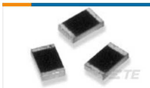
TE Model / Part #1879281-1 RP 2A 309K 0.1% 15PPM CUT LENGTH