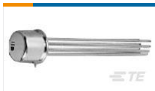
TE Model / Part #1-1617138-0 MAW-26S = RELAY