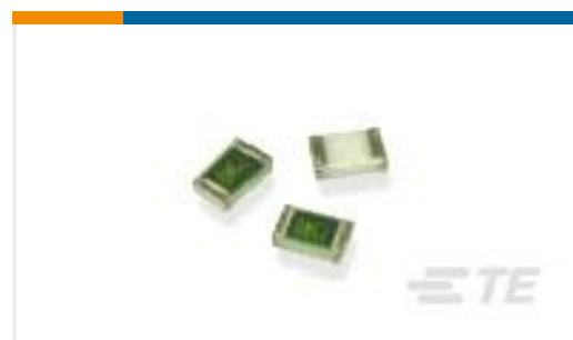
TE Model / Part #1614379-5 RN 0805 12K 0.1% 10PPM CUT LENGTH