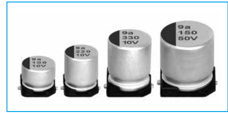
Marking color : Black print