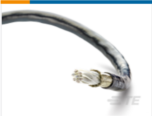
TE Model / Part #E447563001 VG-95218-T028-E010CK3100