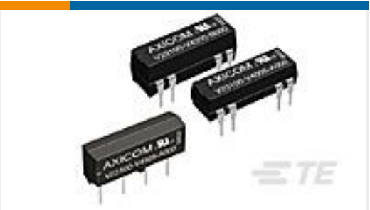
TE Model / Part #3-1393763-1 V23100V4312C011