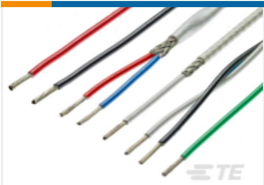
TE Model / Part #061388-000 FLDWD0311-10-0