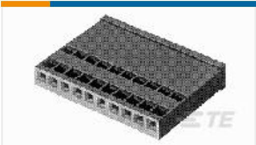
TE Model / Part #1-926657-2 12P LOCKG CLIP GEH