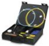
Tool set for GOF assembly

Tool set - FOC-TOOL-GOF KONF SET - 1411049