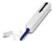
Ferrule cleaner, 1.25 mm, for LC, approx. 500 cleaning cycles

FO accessories - FOC-TOOL-FERRULECLEANER-1.25 - 1407032