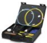
Tool set for GOF assembly

Tool set - FOC-TOOL-GOF KONF SET - 1411049