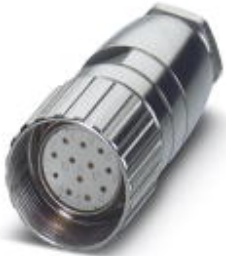
Cable connector, RC, straight, shielded: no, Screw locking, M23, cable diameter range: 9 mm ... 13 mm

Please be informed that the data shown in this PDF Document is generated from our Online Catalog. Please find the complete data in the user's documentation. Our General Terms of Use for Downloads are valid ( http://phoenixcontact.com/download )