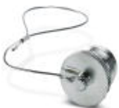
Metal protection cap with steel wire and loop, for M23 signal connectors with knurled nut for fastening to the cable

Metal protective cap - CA-Z0077 - 1627224