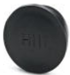
Plastic protection cap, antistatic, for connectors with M23 knurled nut

Plastic anti-static dust protection cap - RC-Z2468 - 1611796