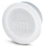
Plastic protection cap for connectors with M23 knurled nut

Plastic anti-static dust protection cap - RC-Z2468 - 1611796