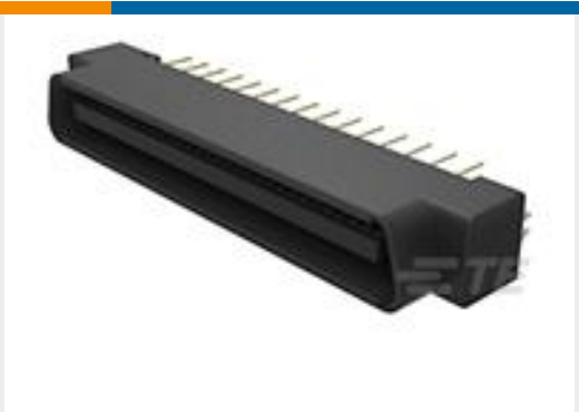
TE Model / Part #3-5175473-1 CHAMP 050 BTB PLUG V 20P W/LEG