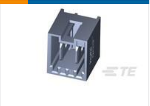
TE Model / Part #3-521383-2 ASSY DIN VERT RAST5 HEADER02-E