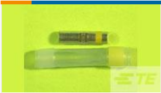
TE Model / Part # 650075-000 D-436-37