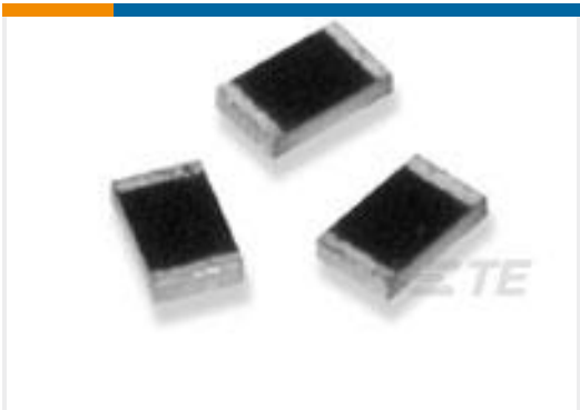
TE Model / Part #7-1879743-7 RP 1J 29R4 0.1% 15PPM CUT LENGTH