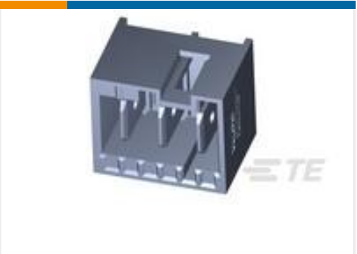
TE Model / Part #521383-3 ASSY DIN VERT RAST5 HEADER03-A