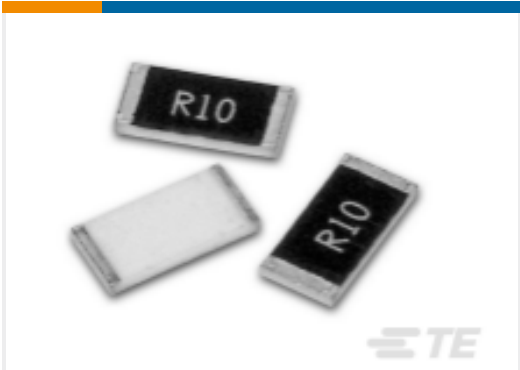
TE Model / Part #1-2176050-0 Thick Film Resistor: Current Sense