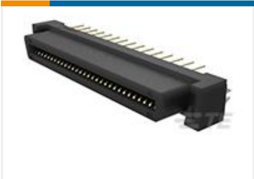
TE Model / Part #5175475-1 CHAMP 050 BTB REC V 20P W/LEG