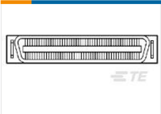
TE Model / Part #5-5175473-1 .050CL CHAMP VERT PLUG 20 POS