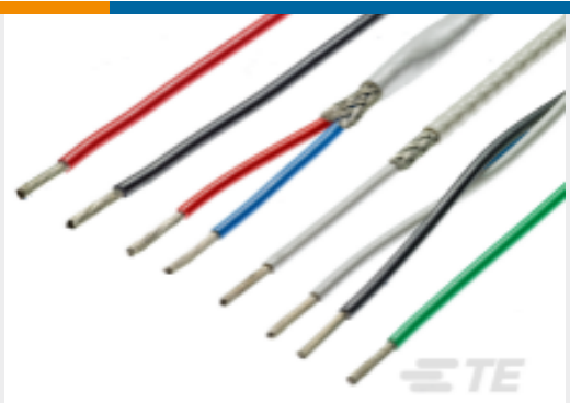
TE Model / Part #1540573002 FLDWC0311-18-9