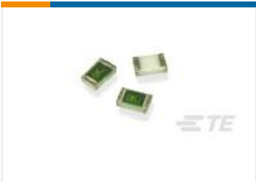
TE Model / Part #9-1879131-7 RN 0402 12K7 0.1% 10PPM CUT LENGTH