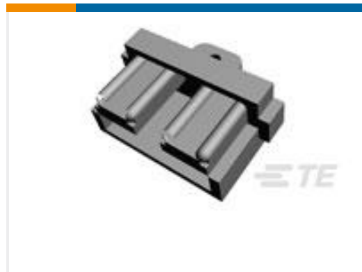
TE Model / Part #1744077-1 DUST COVER,SERIES 50