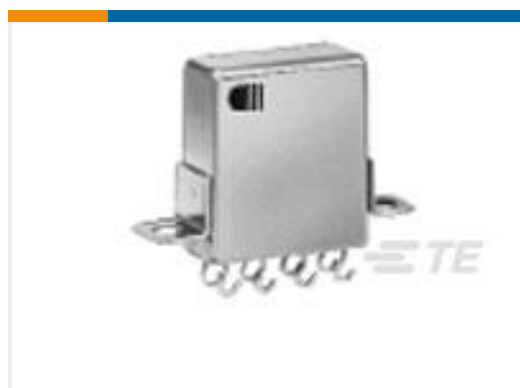
TE Model / Part #1617014-3 3SAT1303A2 = M5757/13-086