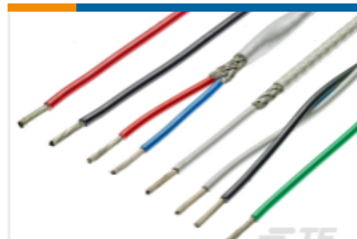
TE Model / Part #240275-000 44AM4121-18-9/96-9CS2275