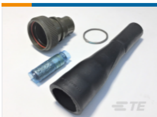
TE Model / Part #254603-000 3024-10-561422-CS2359