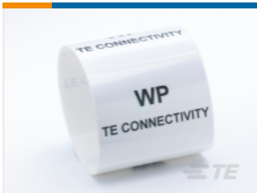
TE Model / Part #E71523-000 WP WHITE POLYESTER LABELS