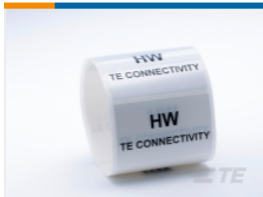
TE Model / Part #F17576-000 HW HIGH TACK WHITE POLYESTER LABELS