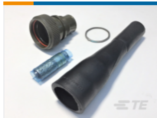
TE Model / Part #A65014N001 3018-10-341012-CS2359