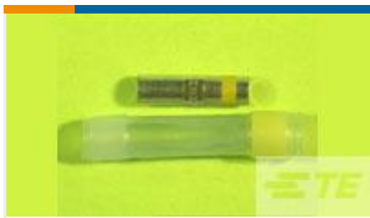
TE Model / Part # 650076-000 D-436-38