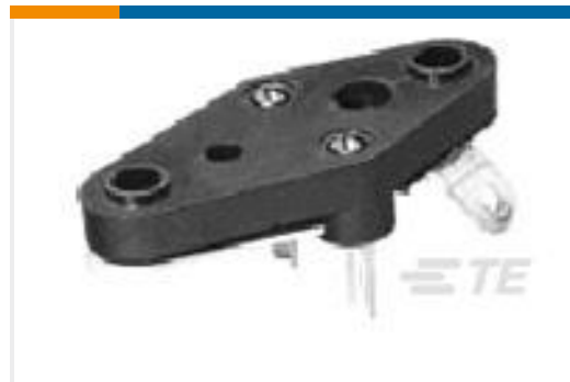
TE Model / Part #6-1437504-6 TRANS SOCKET 8080-1G16 PB-FREE