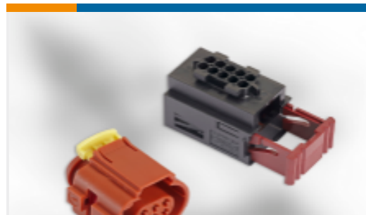
TE Model / Part #1813139-1 TIMER, CONNECTOR HOUSING