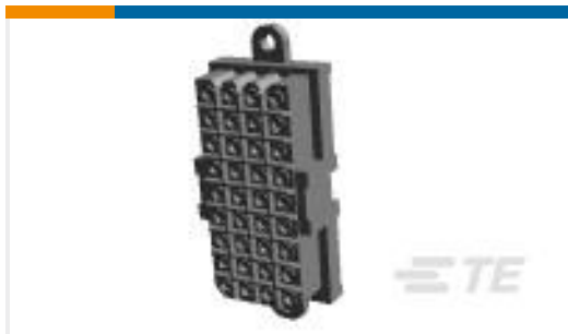
TE Model / Part #207534-8 SKT HDR ASSY,36 POSN,METRIMATE