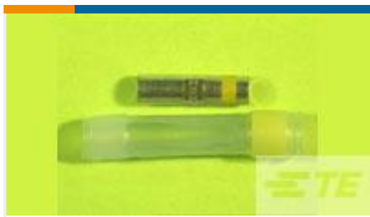
TE Model / Part # 650075-000 D-436-37