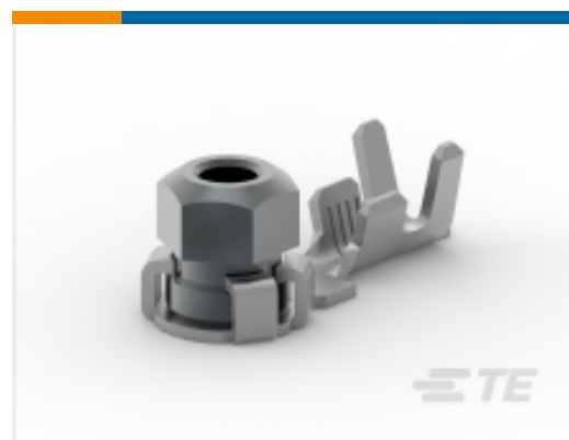
TE Model / Part #2050216-1 Assy' Terminal Ring Tongue M4