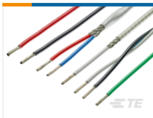
TE Model / Part #1068573002 FLHTC0311-20-9