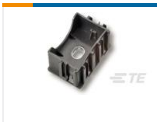
TE Model / Part #2141031-1 FIXATION,BRAKET FOR BOX,ASSY