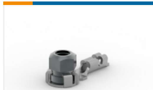
TE Model / Part #1599298-1 RING TONGUE M4