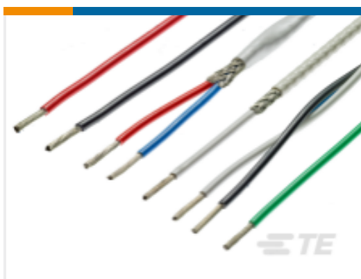
TE Model / Part #6120773002 FLHTC0311-20-5