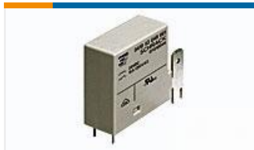
TE Model / Part #8-1415536-6 0410 83 046 001WG