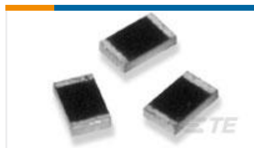
TE Model / Part #1879281-1 RP 2A 309K 0.1% 15PPM CUT LENGTH