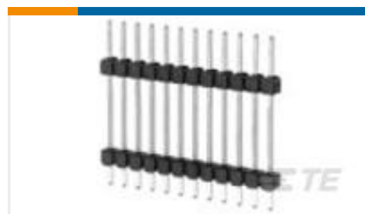
TE Model / Part #6-146459-4 14 MODII HDR SRST UNSHRD STKG