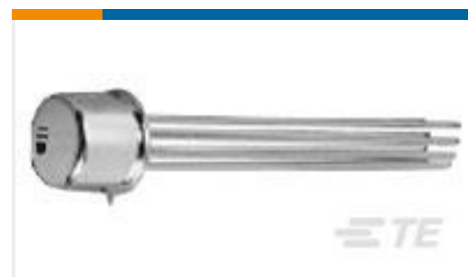
TE Model / Part #1-1617138-0 MAW-26S = RELAY