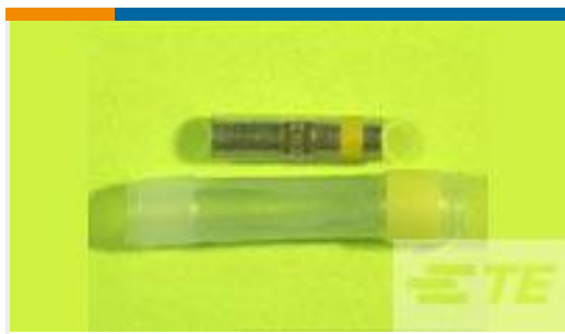
TE Model / Part # 650076-000 D-436-38