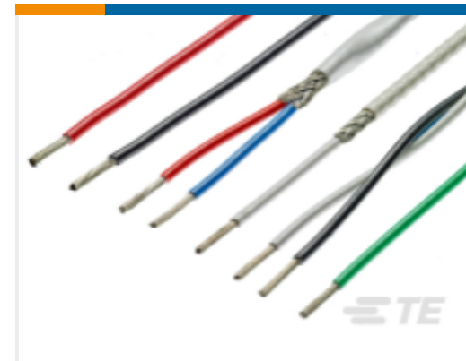
TE Model / Part #2823013001 44A0211-8-9