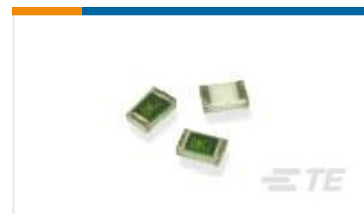
TE Model / Part #1614379-5 RN 0805 12K 0.1% 10PPM CUT LENGTH