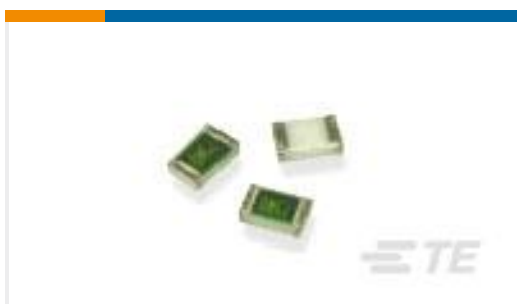
TE Model / Part #5-1676274-4 RN 0805 27K 0.1% 10PPM 1K RL