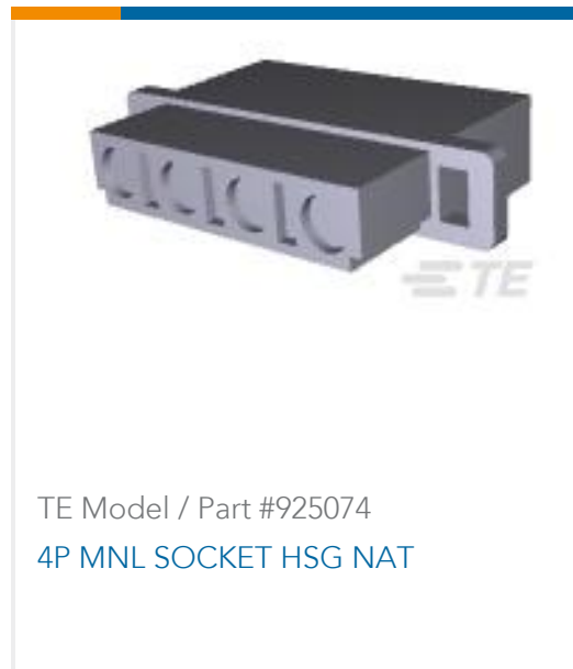
TE Model / Part #925074 4P MNL SOCKET HSG NAT