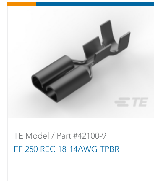
TE Model / Part #42100-9 FF 250 REC 18-14AWG TPBR