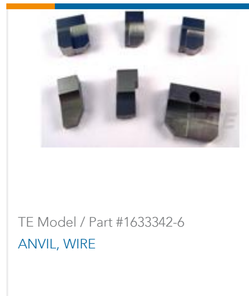
TE Model / Part #1633342-6 ANVIL, WIRE