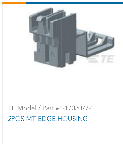
TE Model / Part #1-1703077-1 2POS MT-EDGE HOUSING