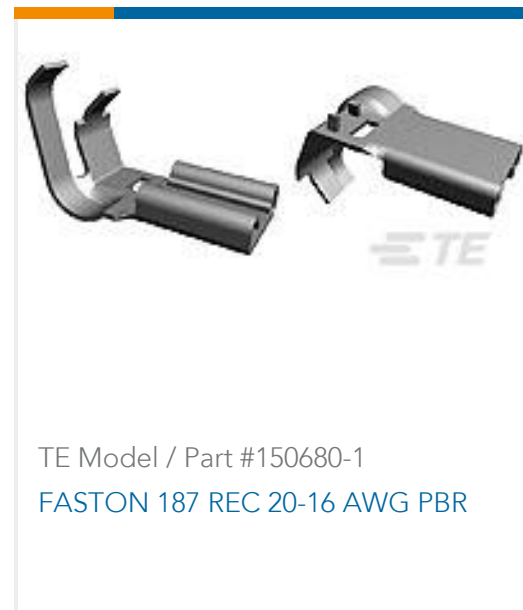
TE Model / Part #150680-1 FASTON 187 REC 20-16 AWG PBR