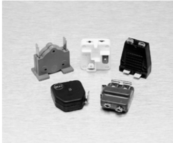
Motor Start Relays