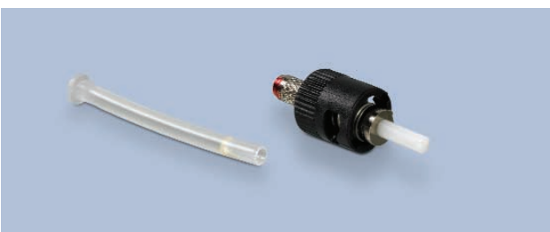
FST EASYFIT connector