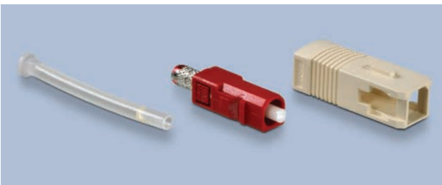
FSC-CMAX EASYFIT connector