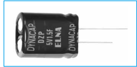
Marking color : White print on a blue sleeve