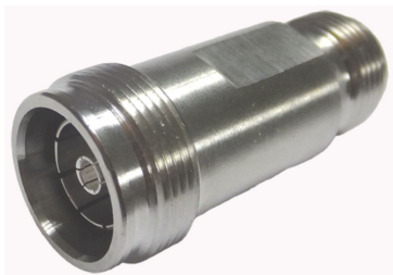
N Female to 4.3-10 Female Low-PIM Adapter