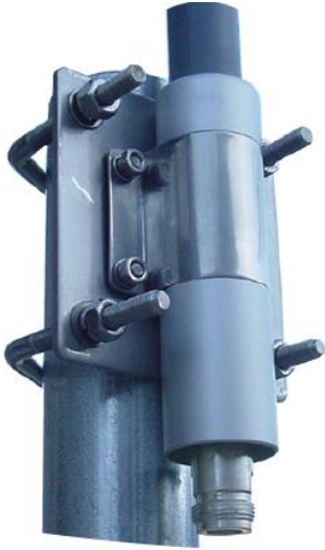
Figure 1: Mast Mount