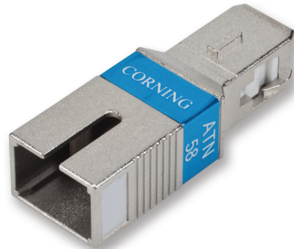
Part Number: ATN-58-17