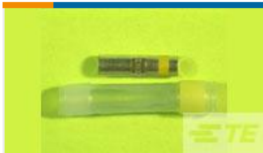
TE Model / Part # 650075-000 D-436-37