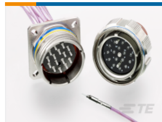
TE Model / Part #YMC8016-F-13-04SN0 ARINC 801, 38999 STYLE, SIZE 13-04