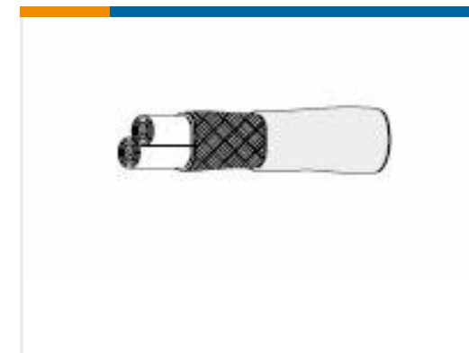
TE Model / Part #8367193002 55/9957-26-6/6-9(LAT3)