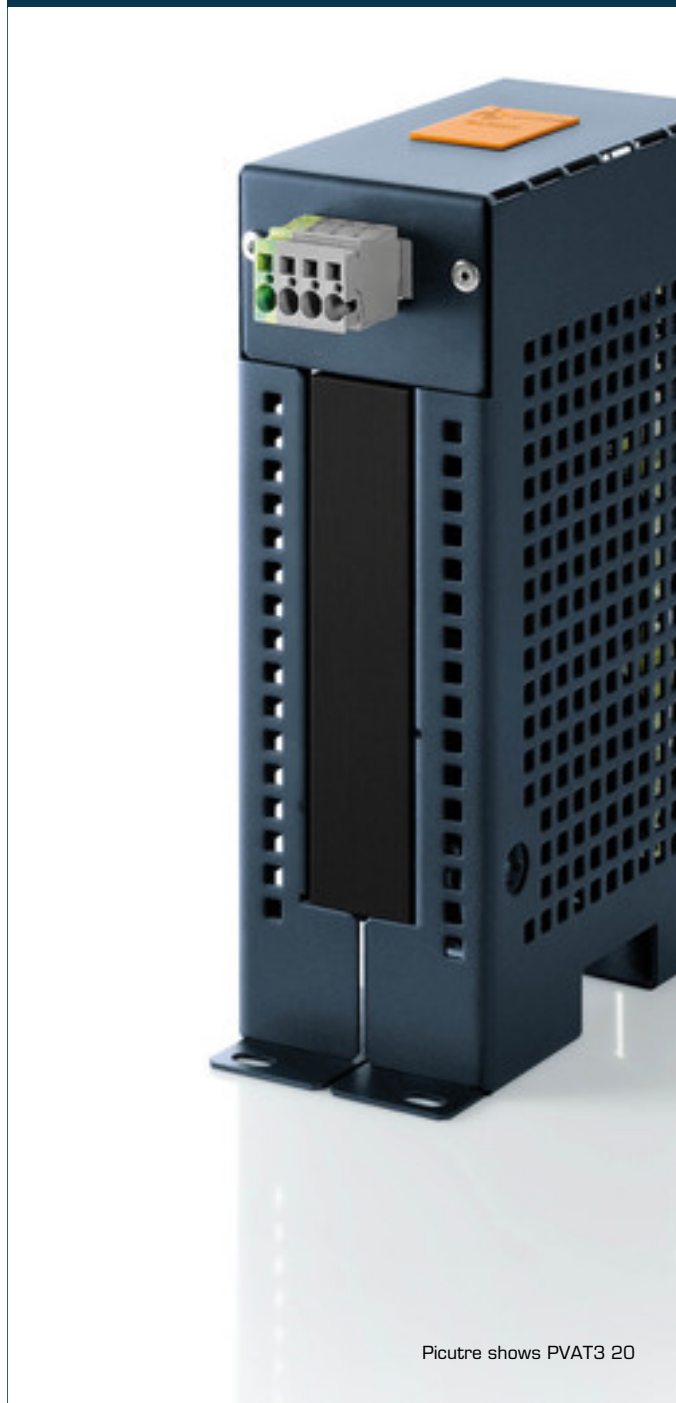
Picture shows PVAT3 20