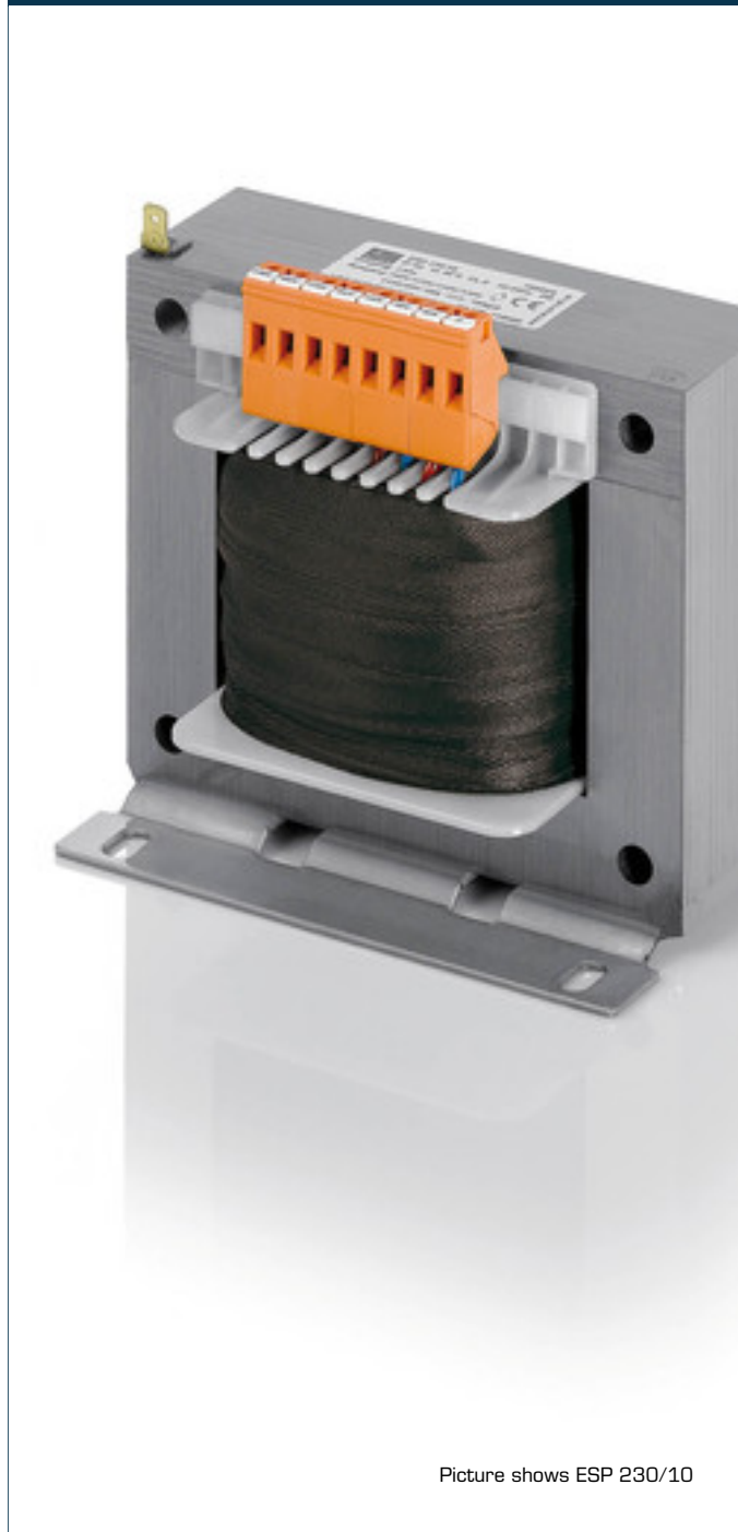
Picture shows ESP 230/10