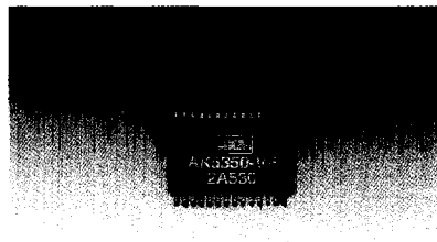
28pin VSOP (5.6×9.8×1.2mm)