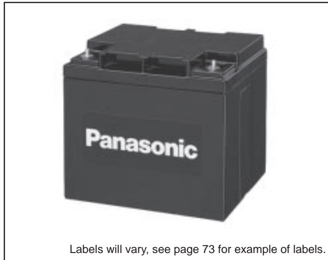
Labels will vary, see page 73 for example of labels.

(a) The photo and dimensions represent LC-X1238AP