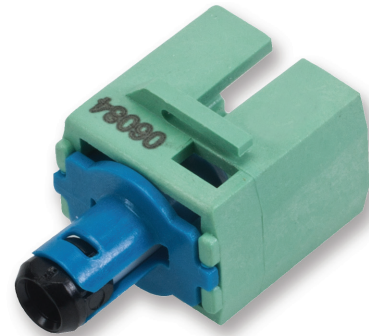
Part Number: ATN-38U-BO-07