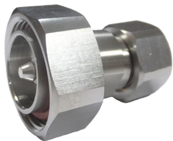
7-16 DIN Male to 4.1-9.5 DIN Male Low-PIM Adapter