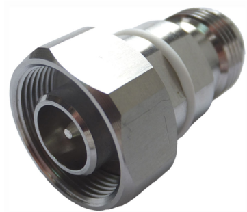
Type N Female to 4.1-9.5 DIN Male Low-PIM Adapter