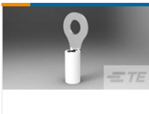
TE Part #50841 TERMINAL,PIDG PTFE R 14 1/4