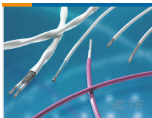
TE Part #422362-000 55A4841-22-MST4-9CS2275