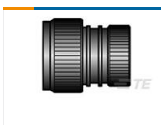
TE Part #683193-000 HEX40-AC-00-13-A3-C