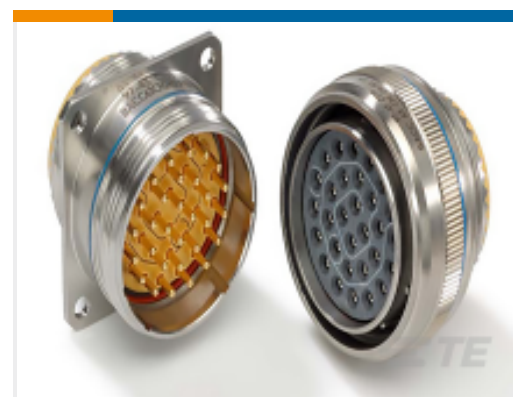
TE Part # ZPF000000000037096 983-6SE 20-25 S7