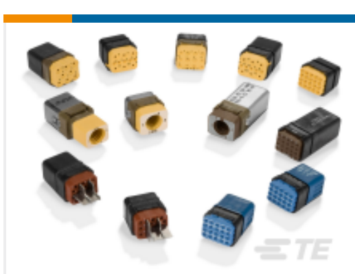
TE Part # ZPF000000000015212 DMC-M 08-16 AA