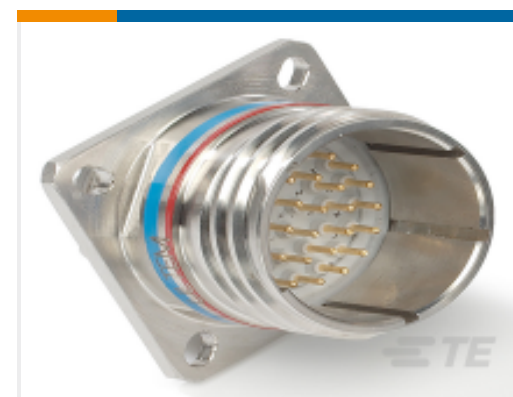
TE Part # YACT20MJ35SDV00100 SQUARE FLANGE RECEPTACLE