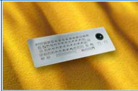
PC Keypad with Trackball Unit

In addition to the standard types, additional versions as well as laser lettering are available on request. Starting with catalogue page 36 you will find an overview of the various designs.