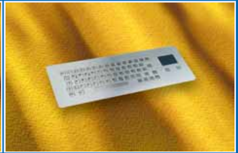
PC Keypad with Touchpad