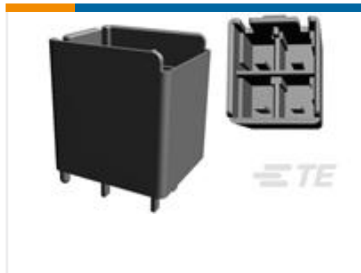
TE Model / Part #1376386-2 5mm B-T-W Conn. 4P(2row) HDR A