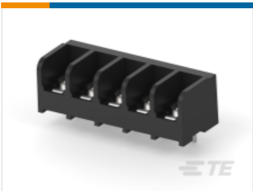
TE Model / Part #8-1437652-6 6PCV-05-1341-#6 TRIBARRIER - S