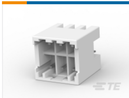
TE Model / Part #2-1971906-7 Glow Wire GRACE INERTIA Header