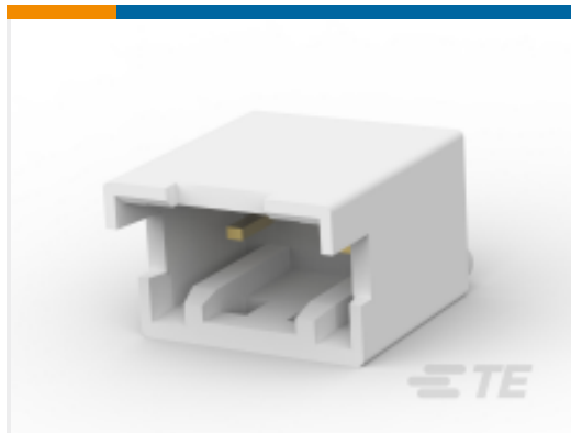
TE Model / Part #3-2232501-1 Glow Wire Sig GRACE INERTIA Header