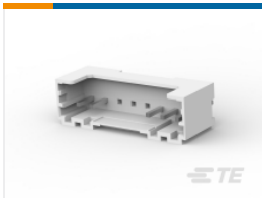
TE Model / Part #1971200-1 GIC 2.0 EV 5/8P HEADER ASSEMBLY