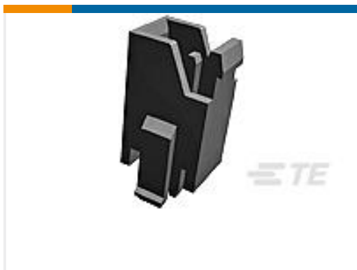
TE Model / Part #2-1123824-1 EP 1P HDR YELLOW