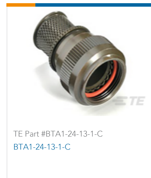
TE Part #BTA1-24-13-1-C BTA1-24-13-1-C