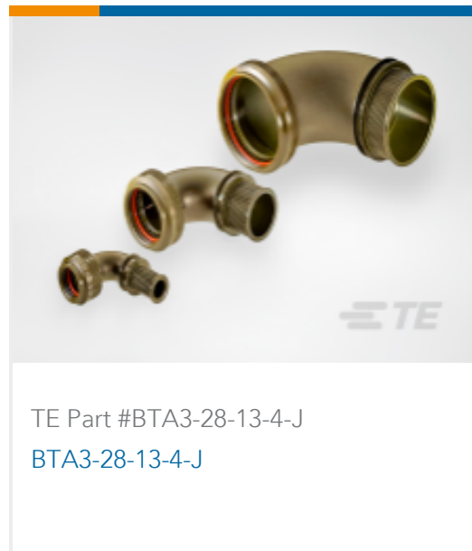
TE Part #BTA3-28-13-4-J BTA3-28-13-4-J