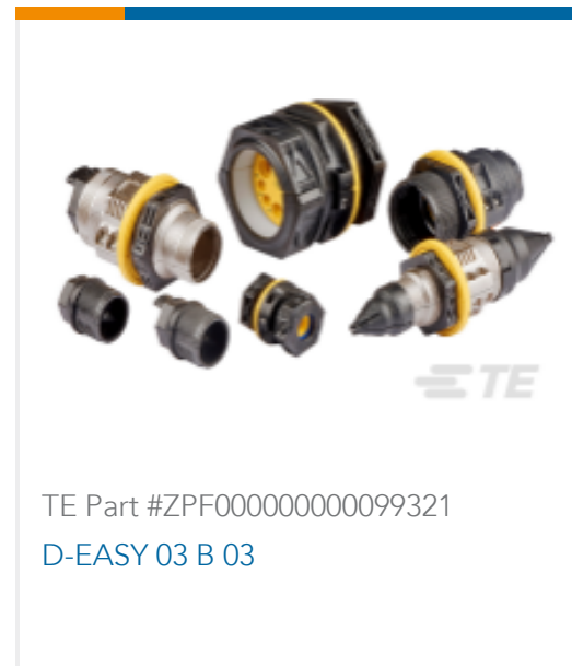
TE Part #ZPF000000000099321 D-EASY 03 B 03