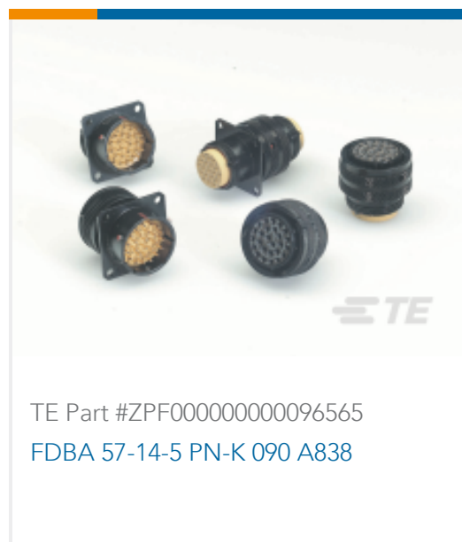
TE Part #ZPF000000000096565 FDBA 57-14-5 PN-K 090 A838