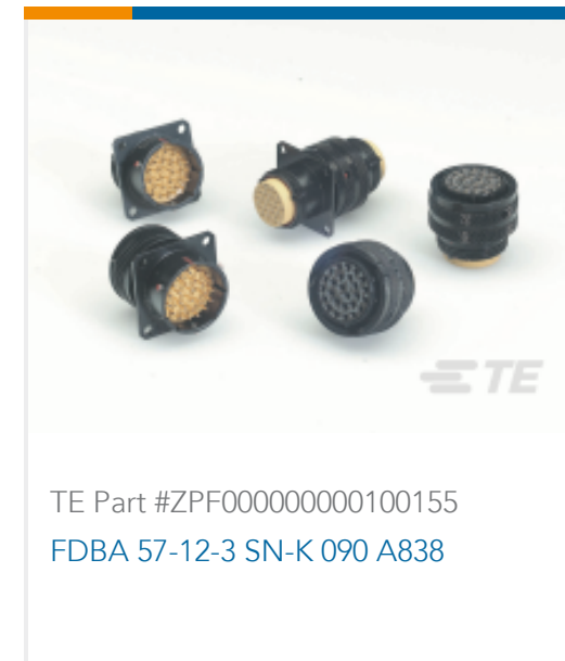
TE Part #ZPF000000000100155 FDBA 57-12-3 SN-K 090 A838