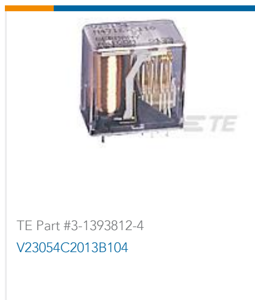
TE Part #3-1393812-4 V23054C2013B104