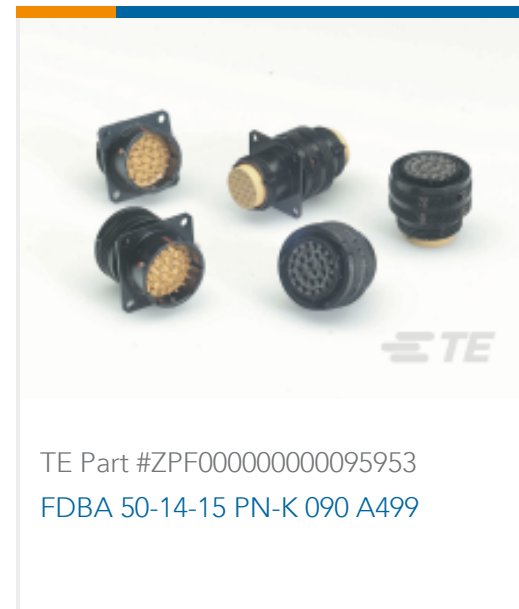
TE Part #ZPF000000000095953 FDBA 50-14-15 PN-K 090 A499