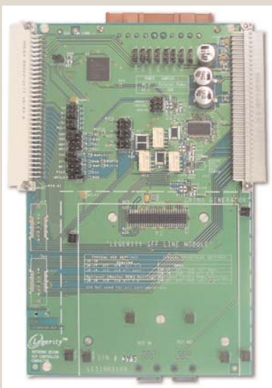
VCP Application Board