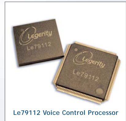
Le79112 Voice Control Processor