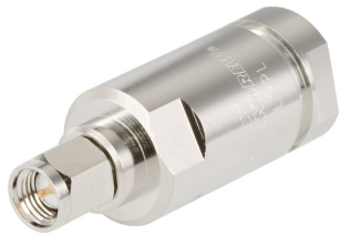
SMA Male Positive Lock for 1/4 in LDF1-50 cable