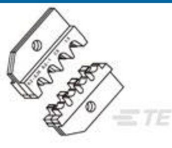
TE Part #539653-2 MATRIZE .250 FF