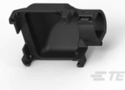
TE Part #776665-1 Wire Cover, V Type, 49 Position