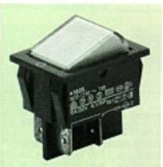
ILLUMINATED, DOUBLE POLE R19 16A-125V AC, 1/8 HP R61 10A-250V AC, 1/3 HP