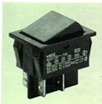
NON-ILLUMINATED, DOUBLE POLE R62 16A-125V AC, 1/8 HP, 10A-250V AC, 1/3 HP