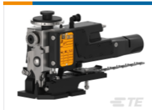
TE Model / Part #2150524-2 OCEAN_2.0_APPLICATOR-E-210F3000