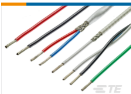
TE Model / Part #CP0388-000 FLHTC0311-18-3