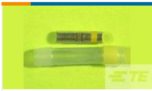
TE Model / Part # 650075-000 D-436-37