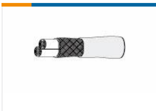
TE Model / Part #318113-000 55A1131-20-9/93/96-9