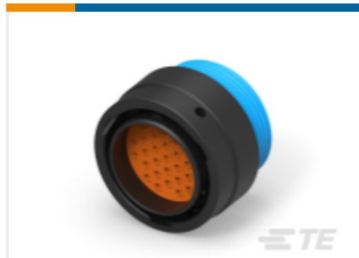
TE Model / Part #YHDP26-24-31PEL024 PLG, 31P, BLK, E, WTHD, 16, P