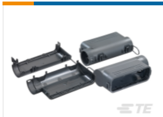
TE Model / Part #2500034-3 SRC Female Conduit Cover