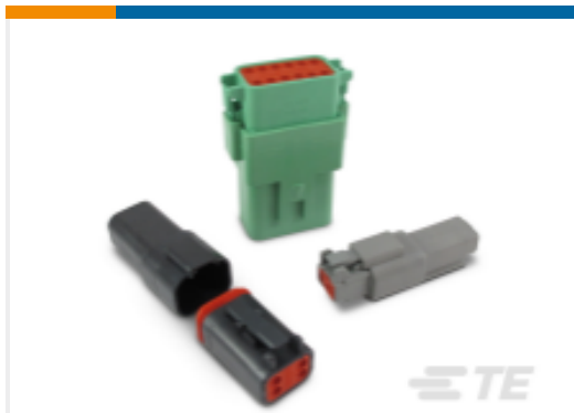
TE Model / Part #2298136-2 DEUTSCH DT HOUSINGS