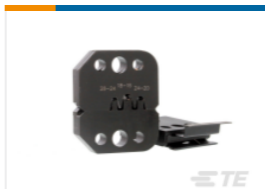
TE Model / Part #91390-2 PRO-C DIE ASSY 1MM SYS.