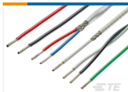
TE Model / Part #203795-000 FLHTC0311-16-1