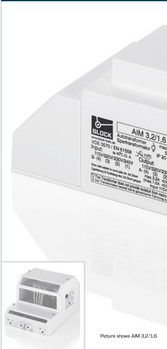
Picture shows AIM 3,2/1,6