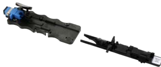
3M™ No Polish Connector Assembly Tool