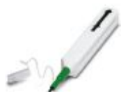
2.50 mm ferrule cleaner, for ST, SC, FC, E2000 (also APC), approx. 500 cleaning cycles