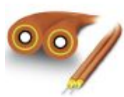
Fiber optic cable, multi-mode fiberglass 50/125 µm, OM2, length: various