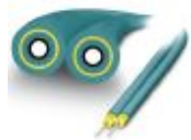
Fiber optic cable, multi-mode fiber glass 50/125 µm, OM3, length: various