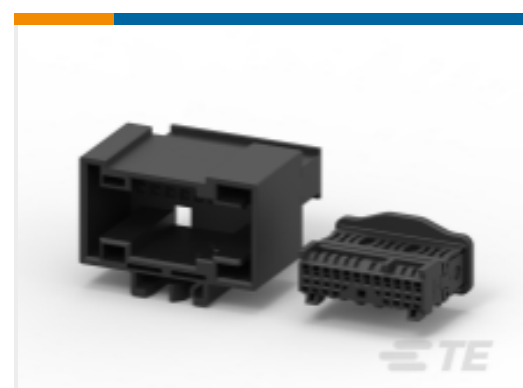
TE Model / Part #9-1563194-9 MQS, CONNECTOR HOUSING