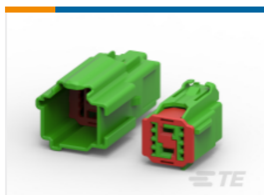
TE Model / Part #1670249-2 GET .64 CONNECTOR SYSTEM, CONNECTOR HSG