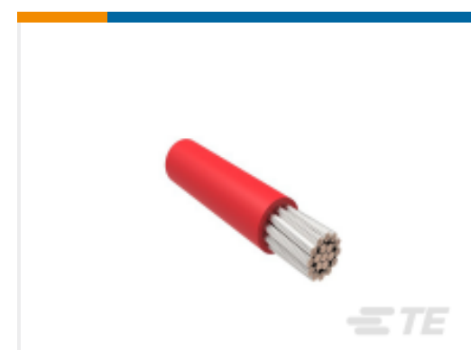
TE Model / Part #E441533001 MPCB-25.00-2