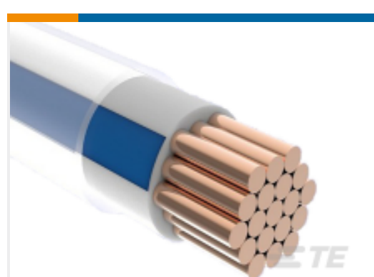
TE Model / Part #CD31193001 ACW0219-0.50-73(NS)