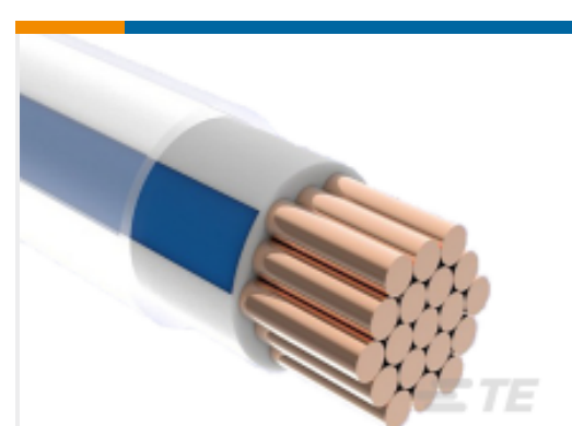
TE Model / Part #1227983001 ACW0219-1.50-06(NS)