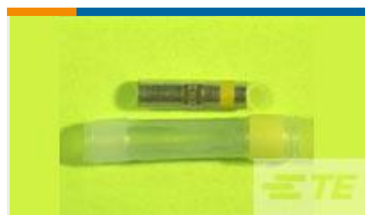
TE Model / Part # 650075-000 D-436-37