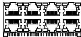
10118077-XX0XXXXLF (WITHOUT PANEL GROUND)