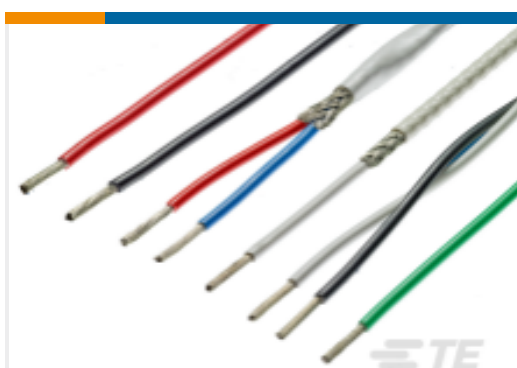
TE Model / Part #382590-000 44A1141-26-0/2/6/9-9