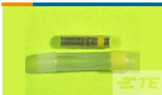
TE Model / Part # 650075-000 D-436-37