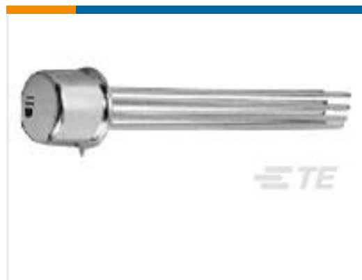
TE Model / Part #1-1617138-0 MAW-26S = RELAY