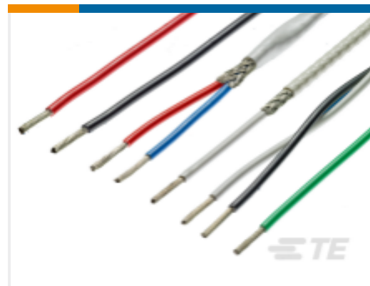
TE Model / Part #2823013001 44A0211-8-9