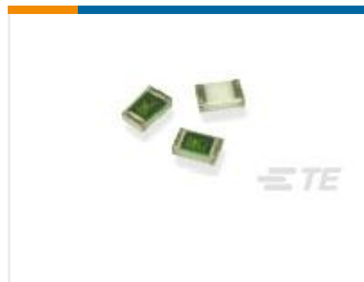
TE Model / Part #1614379-5 RN 0805 12K 0.1% 10PPM CUT LENGTH