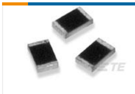
TE Model / Part #1879281-1 RP 2A 309K 0.1% 15PPM CUT LENGTH