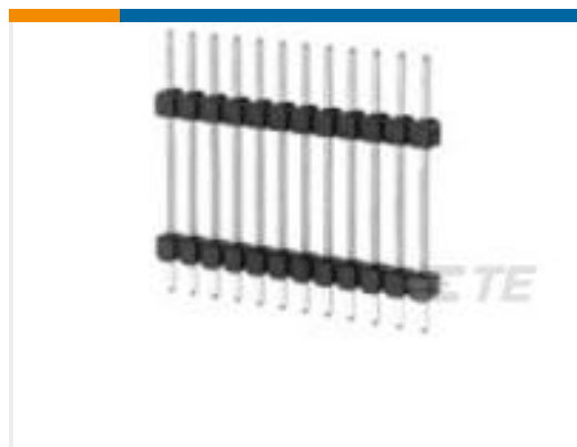
TE Model / Part #6-146459-4 14 MODII HDR SRST UNSHRD STKG