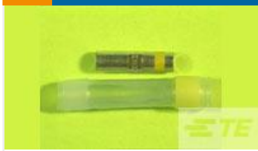
TE Model / Part # 650076-000 D-436-38