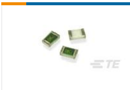
TE Model / Part #5-1676274-4 RN 0805 27K 0.1% 10PPM 1K RL