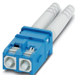
SC-RJ connector, with long bend protection, for single mode 9/125 µm, PC polishing, blue

Please be informed that the data shown in this PDF Document is generated from our Online Catalog. Please find the complete data in the user's documentation. Our General Terms of Use for Downloads are valid ( http://phoenixcontact.com/download )