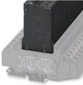
Thermomagnetic circuit breaker, 1-pos., fast blow, 1 N/O contact and 1 N/C contact

Please be informed that the data shown in this PDF Document is generated from our Online Catalog. Please find the complete data in the user's documentation. Our General Terms of Use for Downloads are valid ( http://phoenixcontact.com/download )