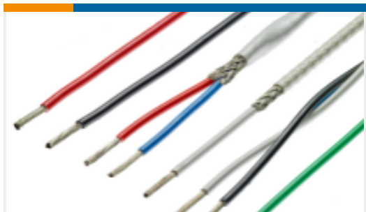
TE Model / Part #7990493002 FLDWC0311-18-0