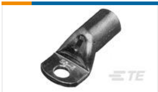
TE Model / Part #710030-5 XCT 16-8