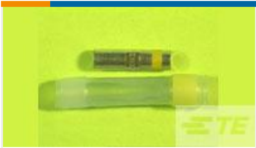
TE Model / Part # 650076-000 D-436-38