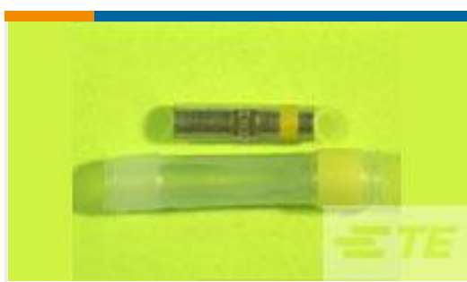
TE Model / Part # 650076-000 D-436-38