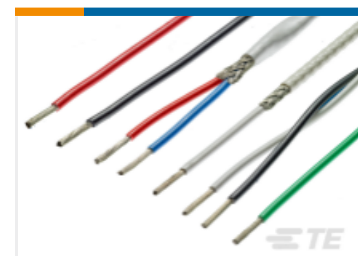
TE Model / Part #2823013001 44A0211-8-9