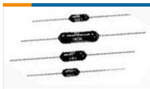
TE Model / Part #8-1879642-3 H8 1K11 0.1% 5PPM