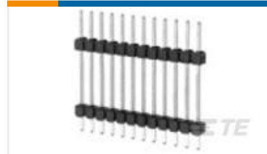
TE Model / Part #6-146459-4 14 MODII HDR SRST UNSHRD STKG