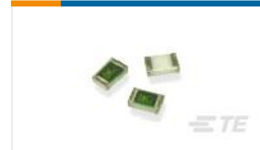
TE Model / Part #1614379-5 RN 0805 12K 0.1% 10PPM CUT LENGTH