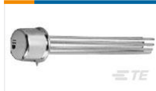
TE Model / Part #1-1617138-0 MAW-26S = RELAY