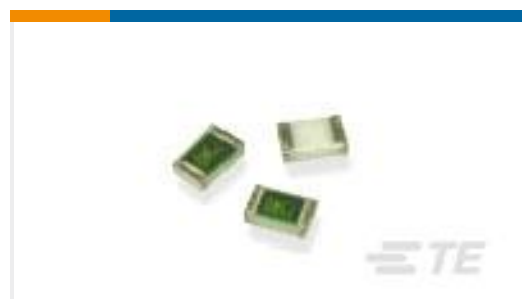
TE Model / Part #5-1676274-4 RN 0805 27K 0.1% 10PPM 1K RL