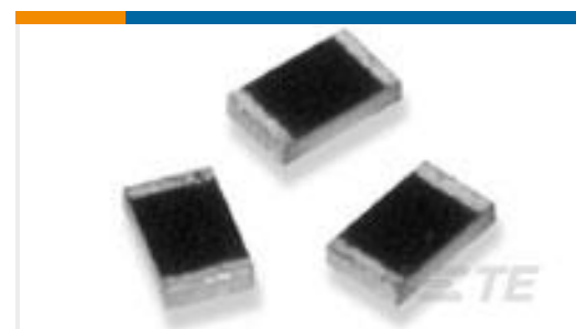
TE Model / Part #1879281-1 RP 2A 309K 0.1% 15PPM CUT LENGTH