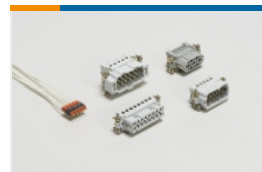
Rectangular Contact Inserts (35)