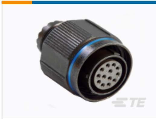
TE Part # YACT26ME06HNV00100 STRAIGHT PLUG