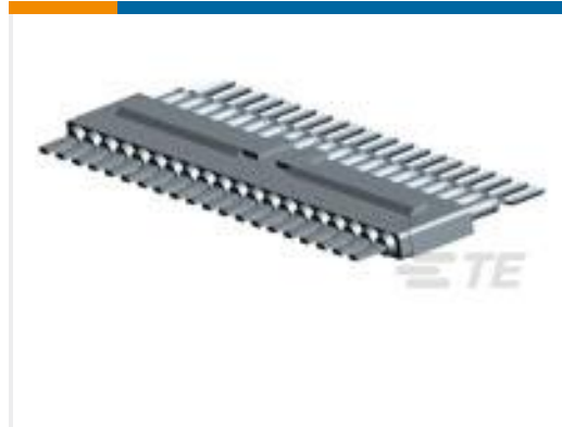
TE Part #699790-000 MTC100-JA2-P11