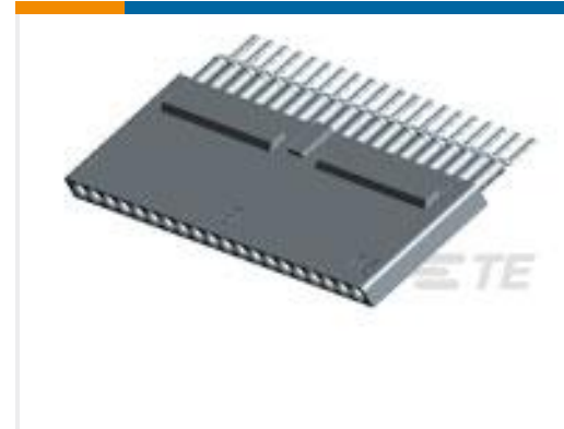
TE Part #699793-000 MTC100-JB2-S11