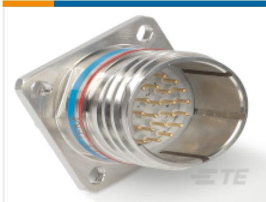
TE Part #YDTS20W09- 35SBV001 RECP ASSY