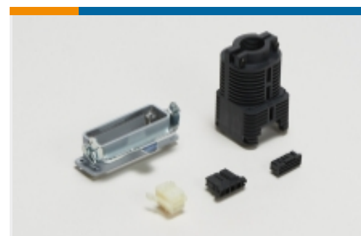
Rectangular Connector Housings(18)