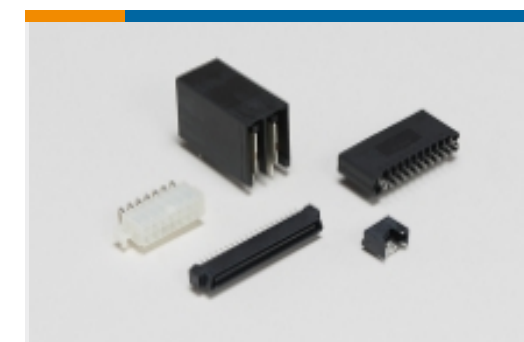
Standard Rectangular Connectors(40)