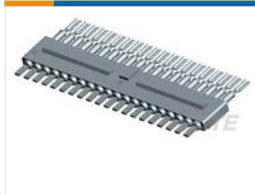
TE Part #699791-000 MTC100-JB2-P11