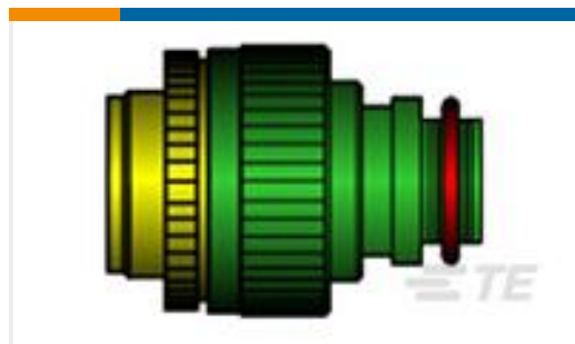
TE Part #497551-000 TXR30AB00-1210AI2