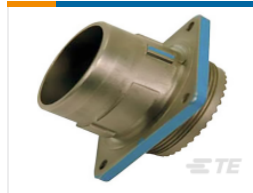
TE Part #YDIV46E25- 19SBV001 PLUG ASSY