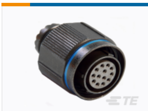
TE Model / Part #YDTS26F21- 35HNV001 PLUG ASSY