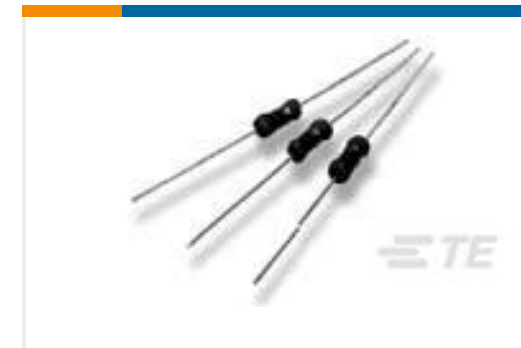
TE Model / Part #3-1879353-1 RR02 5% 75K AMMO