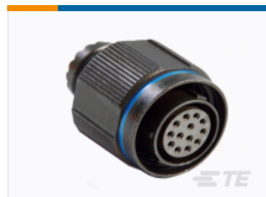
TE Model / Part #YDTS26F21- 35JNV001 PLUG ASSY