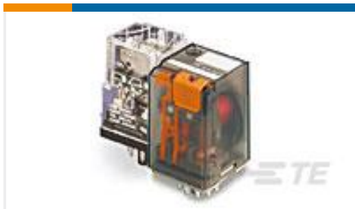
TE Model / Part #7-1393099-3 KA-5AY-120=KA/KB/KC/KR