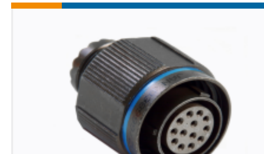
TE Model / Part #YDTS26F17-26JAV001 PLUG ASSY