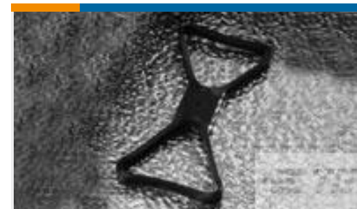
TE Model / Part #296281-000 400W242-25/225-0