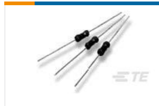
TE Model / Part #2-1879355-5 RR03 5% 43K AMMO