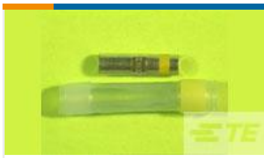
TE Model / Part # 650076-000 D-436-38