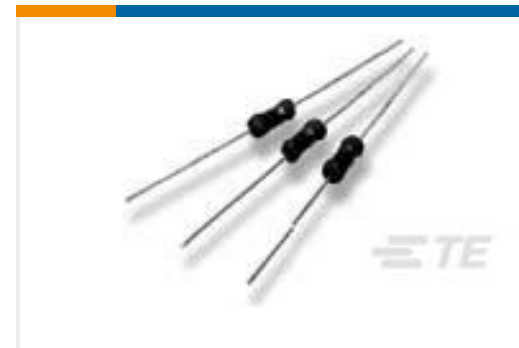
TE Model / Part #5-1625892-7 3W SM M/OX 5% 51K