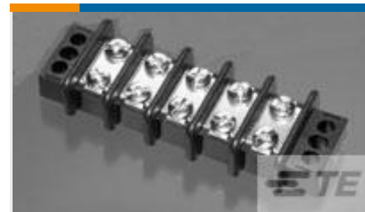
TE Model / Part #1-1546307-4 14P.374" DR BARRIER,W/WASHER